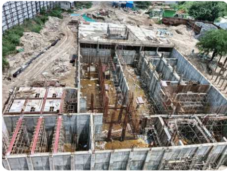
Modular Tank with SBR Technology